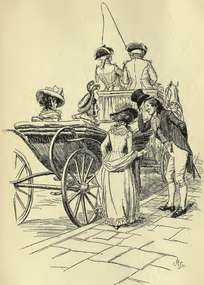
Introduced to Mrs. Jennings.